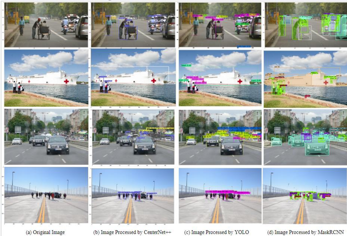
Figure 2. A comparison of the sample image and the processed image by CenterNet++, YOLO, and MaskRCNN.

CenterNet++ outperformed YOLO and MaskRCNN not just in this sample picture, but also in general. According to the experiment, we recorded the FPS and mean average precision (mAP) of their performance on the MS COCO dataset. The result is shown in Table 1. We can see that YOLO is faster than MaskRCNN, but with less accuracy; MaskRCNN is more accurate, but slower. However, CenterNet++ is way better than YOLO and MaskRCNN in both metrics, which concludes that CenterNet++ is better both in speed and accuracy [13].